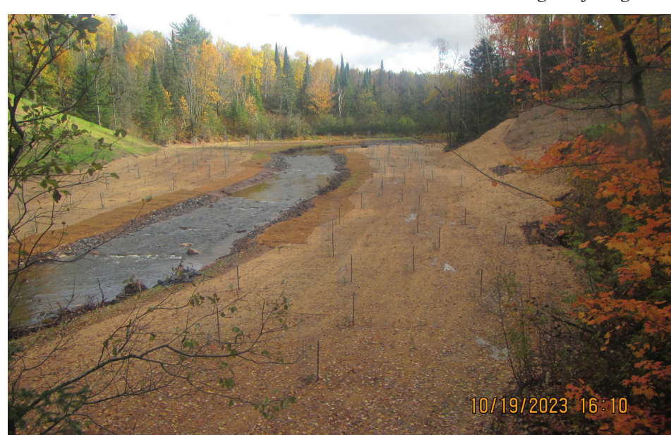
Railroad grade facing up stream.

the content for the fish habitat restoration partnership grant application, which was subsequently submitted by the Commission. With the awarded grants came administrative requirements, such as progress reports, and specific to the Great Lakes Fish Habitat Restoration Partnership Grant, data management and quality assurance documentation. These were prepared and submitted by DNR. In the end, nearly $1,000,000 was raised for the project, which consisted of $56,301