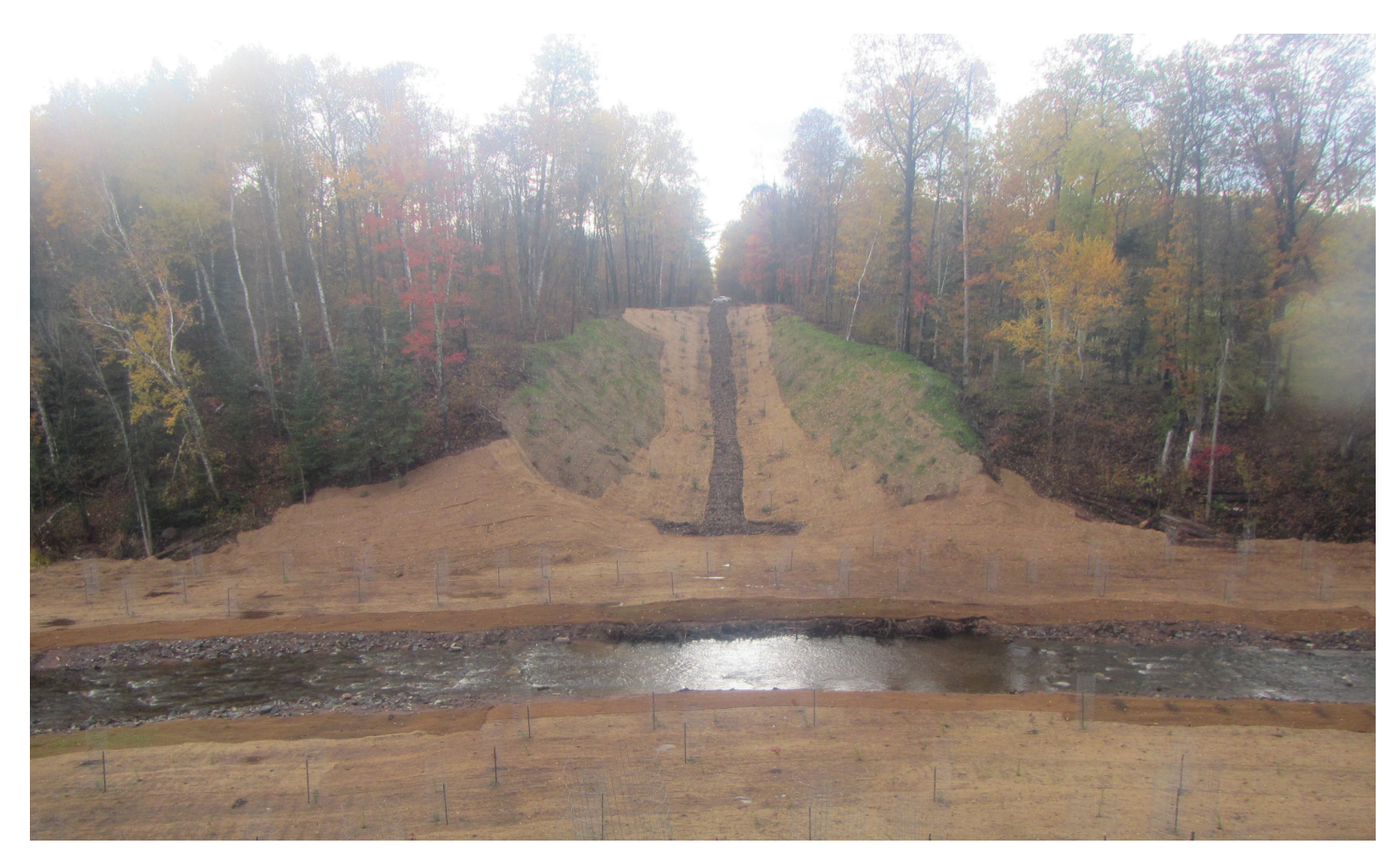
Nebagamon Creek facing west.