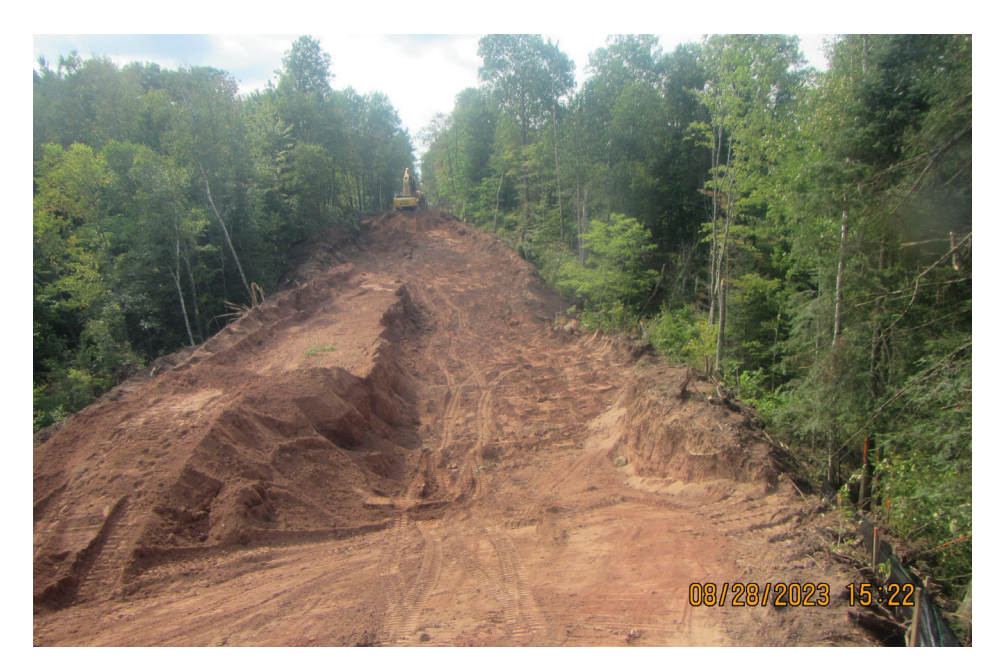
Railroad grade facing west.