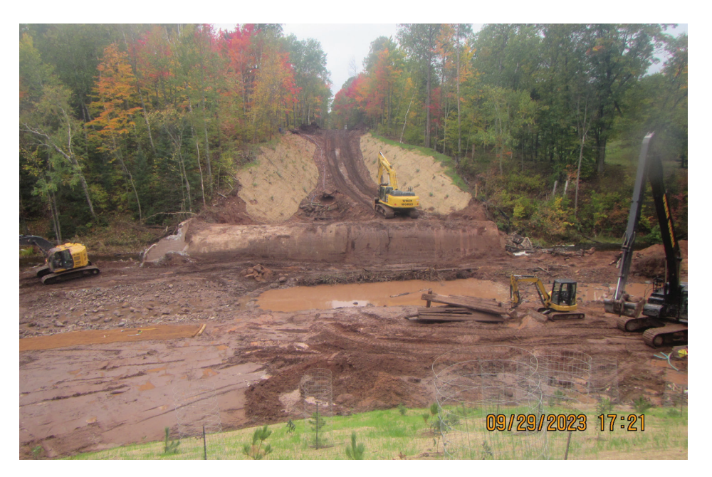
Railroad grade facing west.

Another component of the project's planning process was the procurement of funds beyond those raised by sport clubs, conservation organizations, and the public. DNR Fisheries and the ad hoc group recognized the need for additional funding as the project evolved. In addition to DNR Trout Stamp, funds were requested from two federal sources through grant applications, one of which was submitted to the U.S. Fish and Wildlife Service National Fish Passage Program. The other application was for a National Oceanic and Atmospheric Administration Great Lakes Fish Habitat Restoration Partnership grant, which DNR learned of through its conversations with the Great Lakes Fishery Commission regarding Lake Superior-related projects. DNR Fisheries used many elements from the fish passage grant application to develop