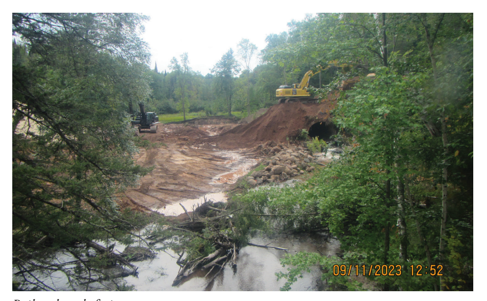
Railroad grade facing up stream.